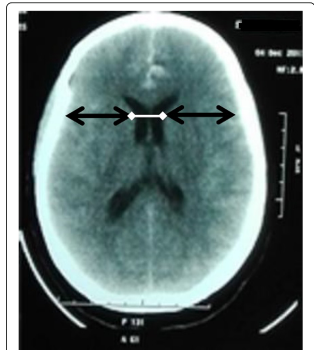
Fig. 1 Axial CT scan showing how to determine bicaudate index (white arrow, both black double arrows). White arrow indicates the width of the frontal horns at the level of the caudate nuclei; black double arrows indicate the diameter of the brain at the same level

Either surgical clipping or endovascular coiling of aneurysms was performed aiming at prevention of rebleeding. In clinically stable patients (GCS 13–15), hydrocephalus was managed conservatively while waiting for the procedure. Close observation of the GCS was carried out in the ICU with serial daily CT scans. Urgent CT scans were performed with deterioration of the level of consciousness (by at least one point) to exclude other causes of disturbed level of consciousness, e.g., rebleeding or expanding hematoma. Deterioration of the level of consciousness