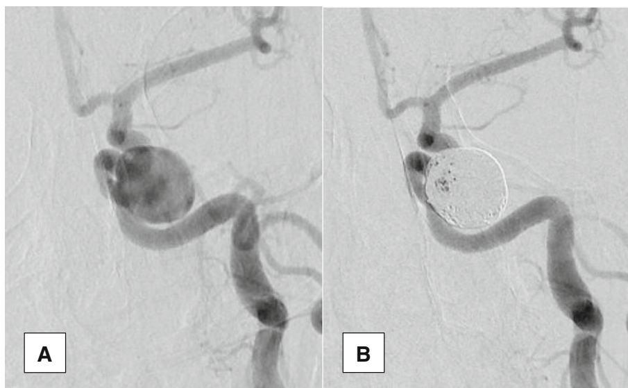
Fig. 3 Carotid cavernous aneurysm before (a) and after (b) coiling. Residual aneurysm with contrast within coil interstices is noticed (class IIIa according to modified Raymond–Roy Classification)

The immediate angiographic outcome showed complete obliteration in 29 aneurysms (82.9%), residual neck in 4 aneurysms (11.4%), and residual aneurysm with contrast within coil interstices in 1 aneurysm (2.9%). The immediate angiographic result of the (AMERICA) study showed that 52/100 aneurysms had complete occlusion, and 33/100 aneurysms had residual neck or dog ear and 15/100 aneurysms residual sac [14]. The Cerecyte coil trial included 500 patients randomized for treatment with either Cerecyte or bare platinum coils for ruptured or unruptured aneurysms. The bare platinum coils arm included 251 patients: 120 patients presented with rupture aneurysms and 131 patients presented with unruptured aneurysms. Seven patients had failed embolization. The image could not be assessed in 10 patients. The immediate